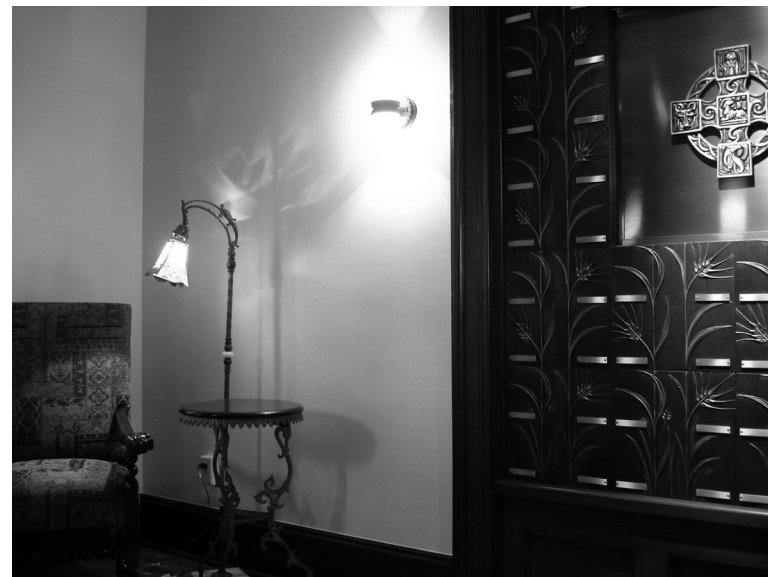
Recently added furnishings in Columbarium Room invite mourners to visit in quiet comfort.

The Laurel Heights Columbarium Ministry invites our LHUMC family to consider this location as the final resting place for their earthly remains. To learn more about the columbarium ministry, go to www.mylhunc.org/home/columbarium-ministry.html or pick up a brochure from one of the Welcome stations around the church.